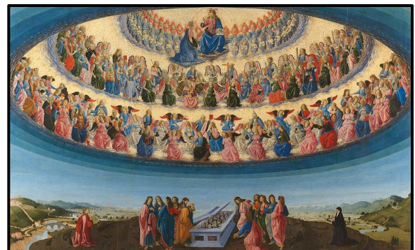
Assumption of the Virgin, by Botticini, a 15 th -century representation of heaven and its angels

H is for Holy Land , an area of the Middle East that today consists of Israel and Palestine. The Holy Land holds great significance for Judaism, Christianity, and Islam, as the location of many foundational events to each religion. The Holy Land has seen countless wars and territorial disputes for many centuries, and has been the destination of millions of pilgrimages.