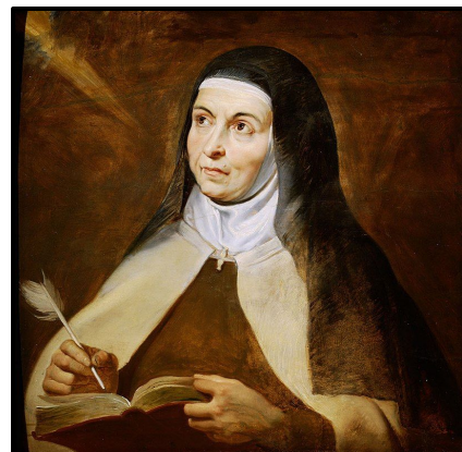
Portrait of Teresa of Ávila by Peter Paul Rubens

(Adapted from More Days for Praise: Festivals and Commemorations in Evangelical Lutheran Worship and The Book of Saints: A Comprehensive Biography )