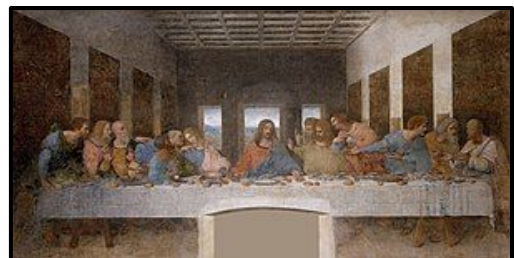
The Last Supper , which shows Jesus and the apostles

A is for apostles , the 12 closest followers of Jesus. They were chosen by him and sent out to proclaim the good news, heal the sick, and cast out demons. They travelled with Jesus during his ministry, and saw his healings and miracles firsthand. Though they fled when he was arrested, Jesus appeared to them after his resurrection and sent them forth to "make disciples of all nations, baptizing them... and teaching them to obey" all that he commanded (Matt. 28:19-20). Several of the apostles - including the three closest to Jesus: Peter, James, and John - were fishermen.